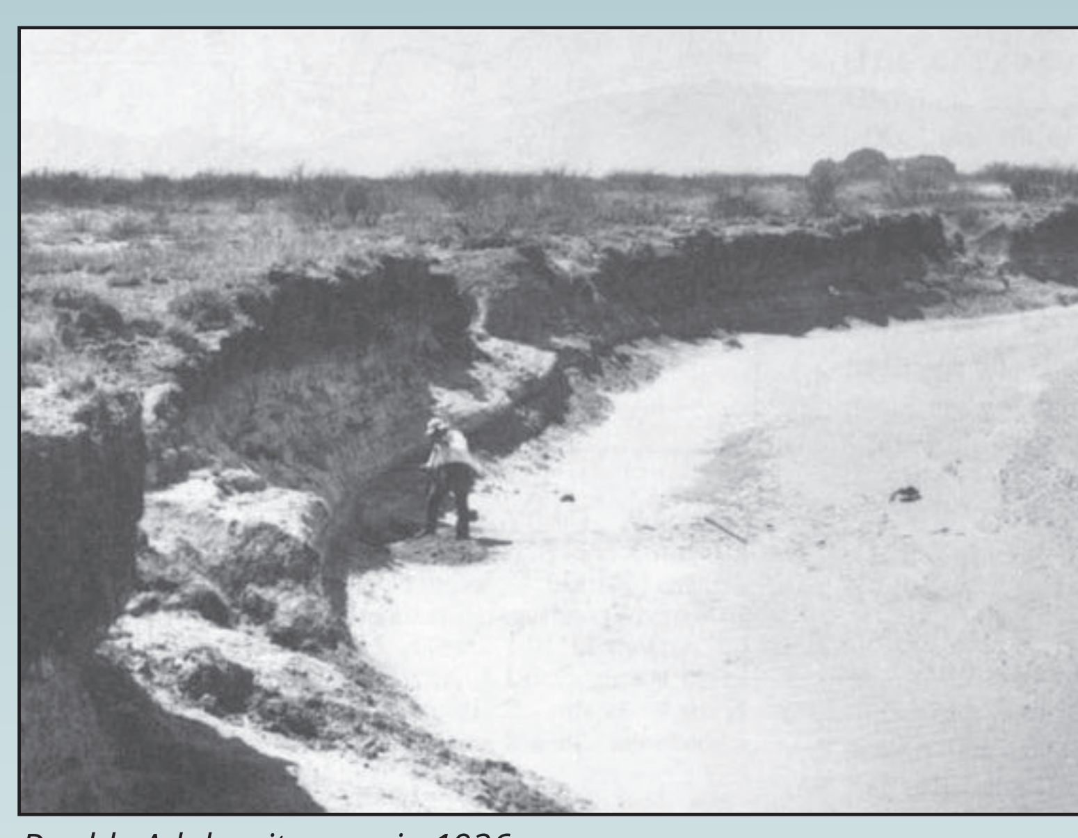
Double Adobe site area in 1936.