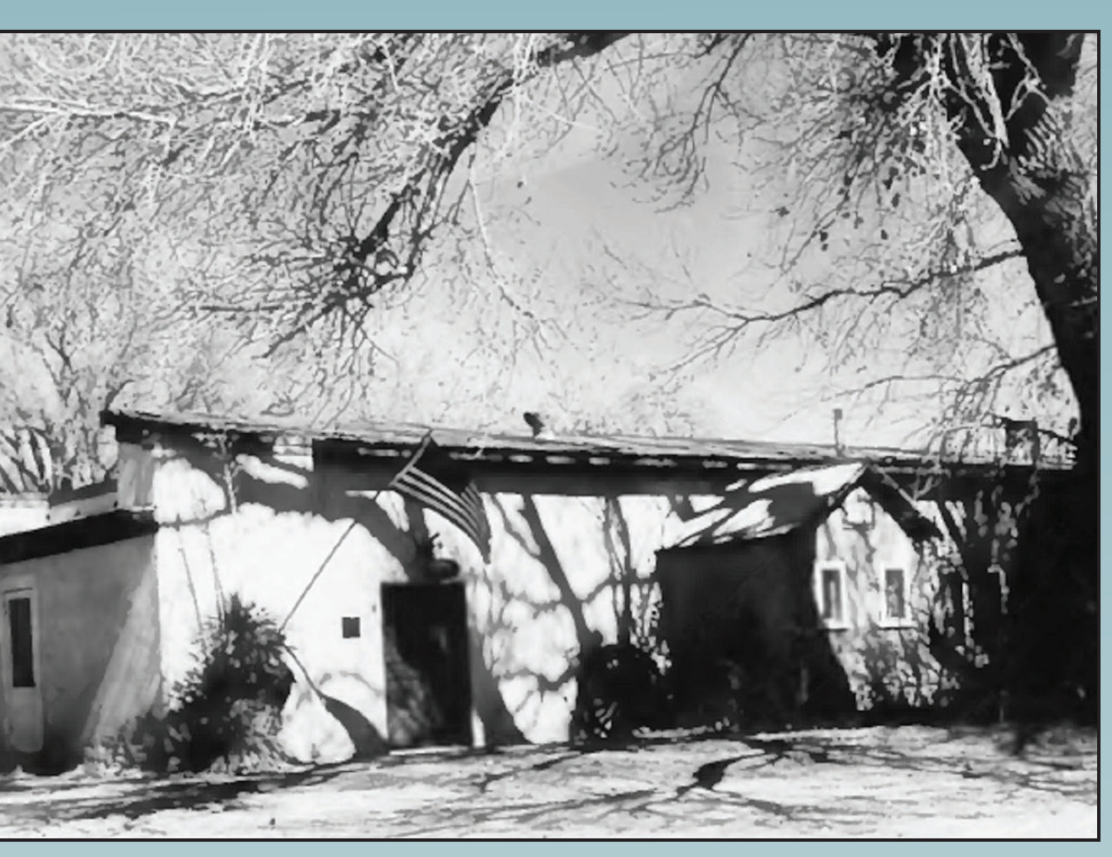
Sierra Bonita Ranch.

The Air Force is conducting required public involvement for NHPA Section 106 consultation for the potential effects on historic properties concurrent with the NEPA process.